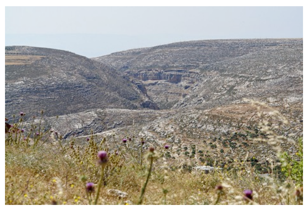
Michmash, Israel--Crucial Place in Ancient History

Near the town of Michmash (MIK-mas, or, MIK-mash), this pass is about 8 miles outside Jerusalem, in the region of the ancient tribe of Benjamin.